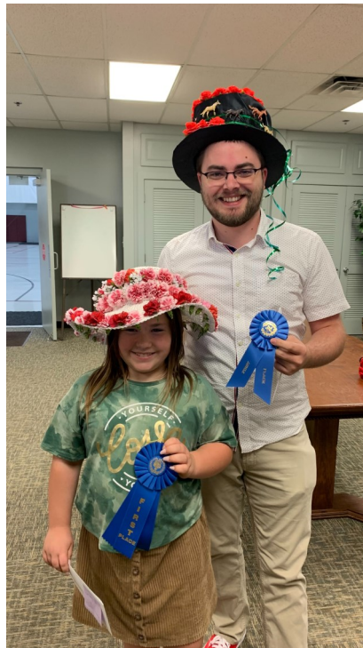
Derby Hat Contest