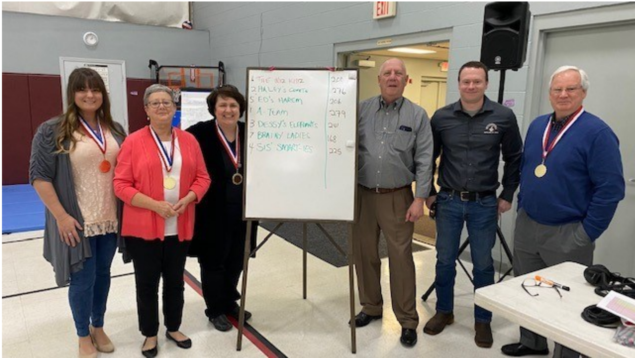
The Winning Trivia Madness Team